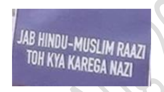
Figure1. Jab Hindu-Muslim Raazi Toh Kya Karega Nazi

ideologies of governance. The main religious identities to be in focus come out to be Hinduism and Islam which is coupled with the fascist regime invoking back to the past of the Nazi rule thereby also instilling the images of genocide associated with it. While this coding gives a vague and surface level understanding, but it makes clear the very categories that the memes are dealing in. Diving into the second way of analysis, a detailed understanding of each meme removes the vagueness and in turn enables to not only scratch the surface of the affair but to understand the latent content of the text.