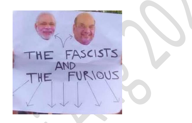
Figure3. The Fascists and The Furious

the political context where orange is predominantly the color of the extreme right wing – The BJP, the RSS and the very color the entire Hindutva ideology is painted in. The significance of the color orange to these parties also lies in Hindu mythologies referring to 'vermilion'(sindhur), and to the many mythologies associated with the same. Having said this, the political meme yet stands as a political critique of the ruling government by reinstating that all the other colors fade out and what stands as the prime colour is Orange the colour of the Hindutva Propogandist movement.