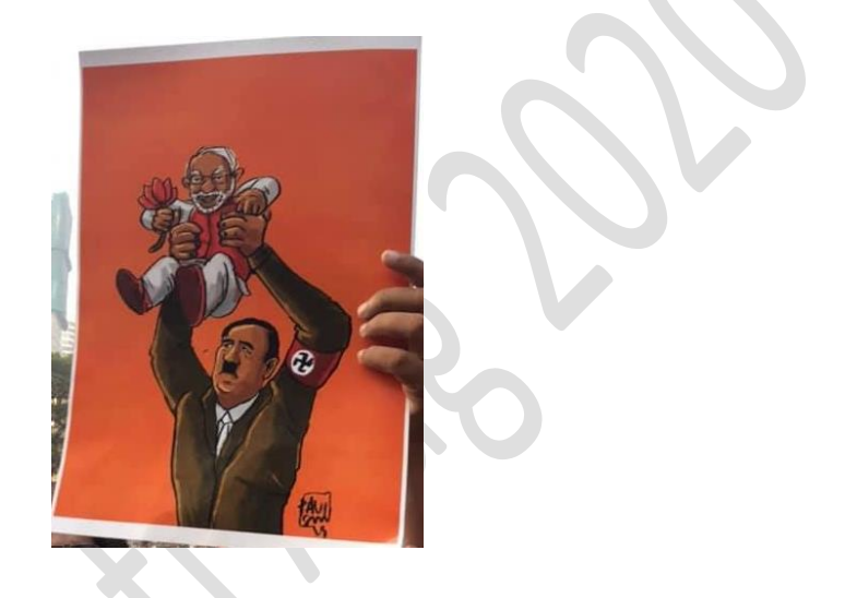
Figure4. ( Hitler holding baby Narendra Modi – a Lion King reference )

opposition, to intertwining of religion and governance. While all of this speaks of the 'Fascists', the very emotion of the meme can be recorded in the Furious, which may refer to the fury on behalf of the government itself, levying out their atrocities and brutality by the hands of the police force on the people or it can also refer to the very sentiment of the protesters who stand against the fascist regime. This meme calls out against the very power structure of the government expressing their dissent, using the vehicle of humor and agency of memes.