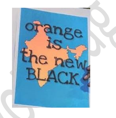
Figure2. Orange is the New Black

The emotions that can be noted in the proverb is that of challenge and questioning – 'Toh Kya Karega' thereby daringly expressing the essence of harmony and brotherhood, against the dividing forces.